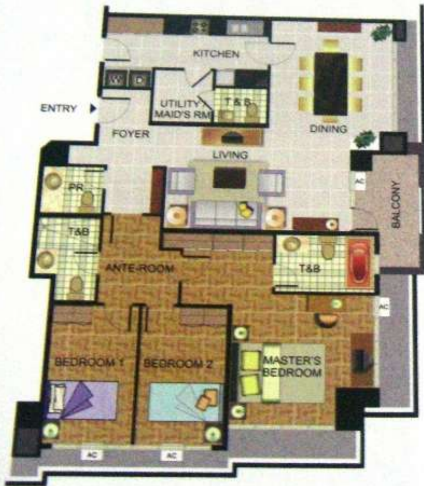
Typical 3 Bedroom Penthouse Unit Approx. 139.00 sqm with Balcony